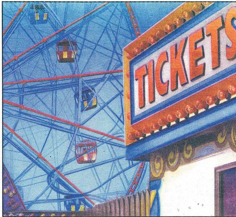
'Tickets, Coney Island' by Laura Fantini (above) and 'Coney Island Overpass' by Thomas Hagen are two of the pieces that will be on display at 'Images of Coney Island' exhibit